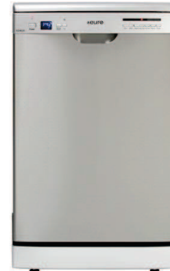
Code ED8GSA 45cm Freestanding Dishwasher