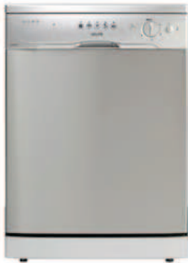
Code ED5DESA 60cm Freestanding Dishwasher