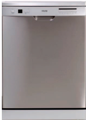
Code ED12GSA 60cm Freestanding Dishwasher